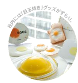
Our office is full of fun sunny-side up goods