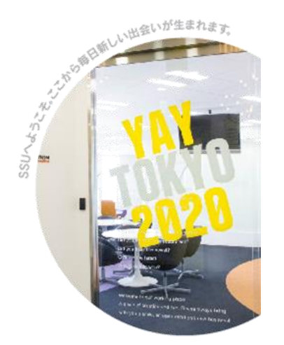
Welcome to SSU where everyday is a new encounter