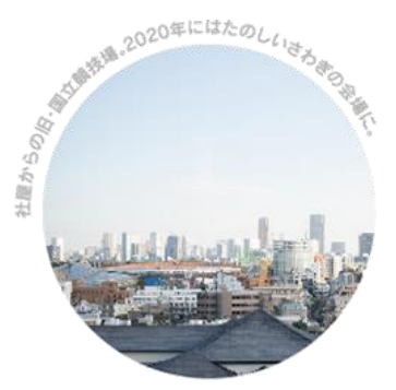
Former National Stadium – Center of all the excitement in 2020!